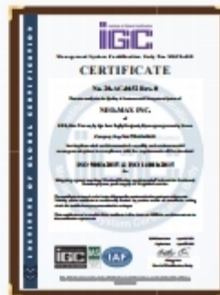
ISO 9001:2015 & ISO 14001:2015